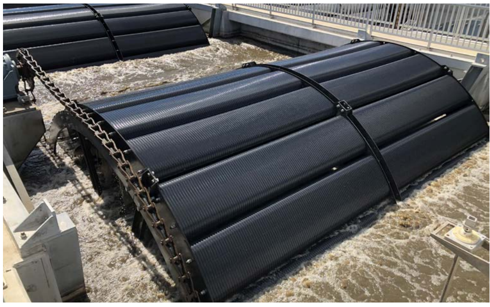
Top: One of the two new secondary clarifiers. Bottom: New aeration basin with bio-wheels.