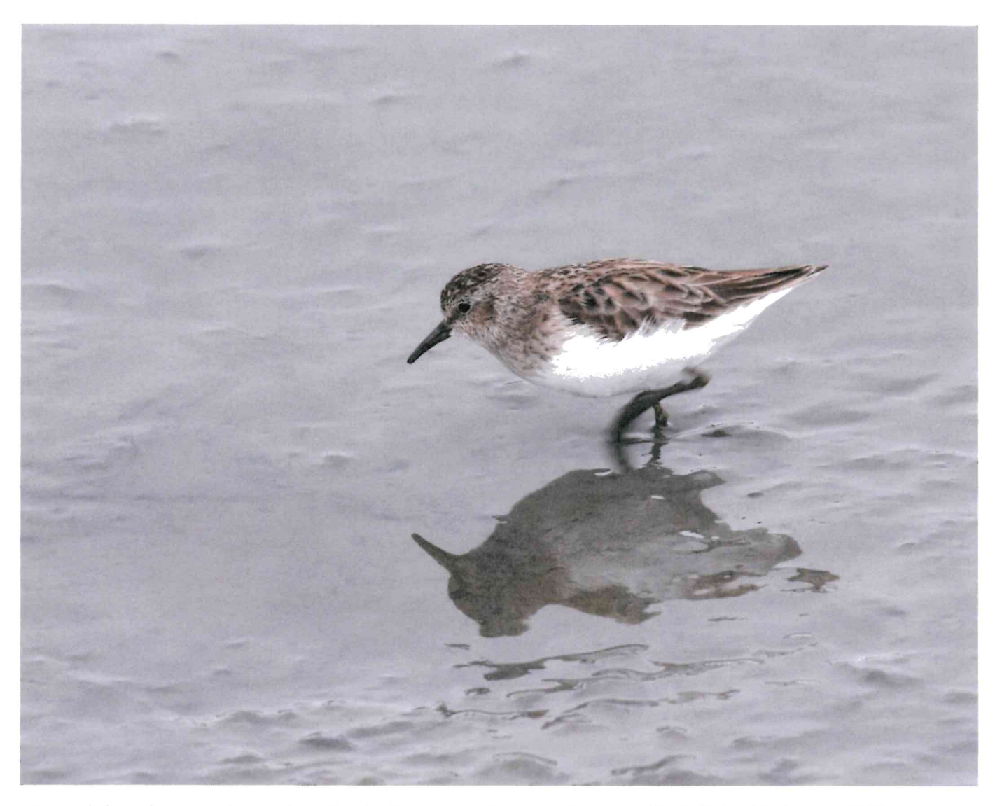
A sandpiper forages during low tide in the marsh in Corte Madera.