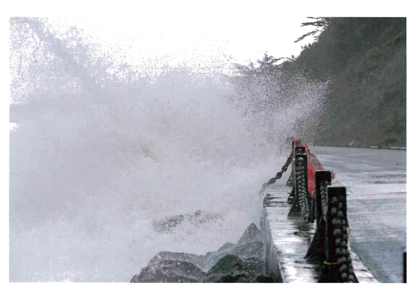
Waves crash and go over the railing at Fort Point in San Francisco on Dec. 30, 2023.