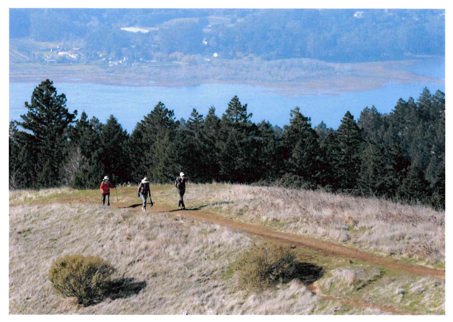
Hikers walk along the Willow Camp Fire Road on Mount Tamalpais. The Marin Municipal Water District has a 90-mile network of fire roads in the Mount Tamalpais watershed.