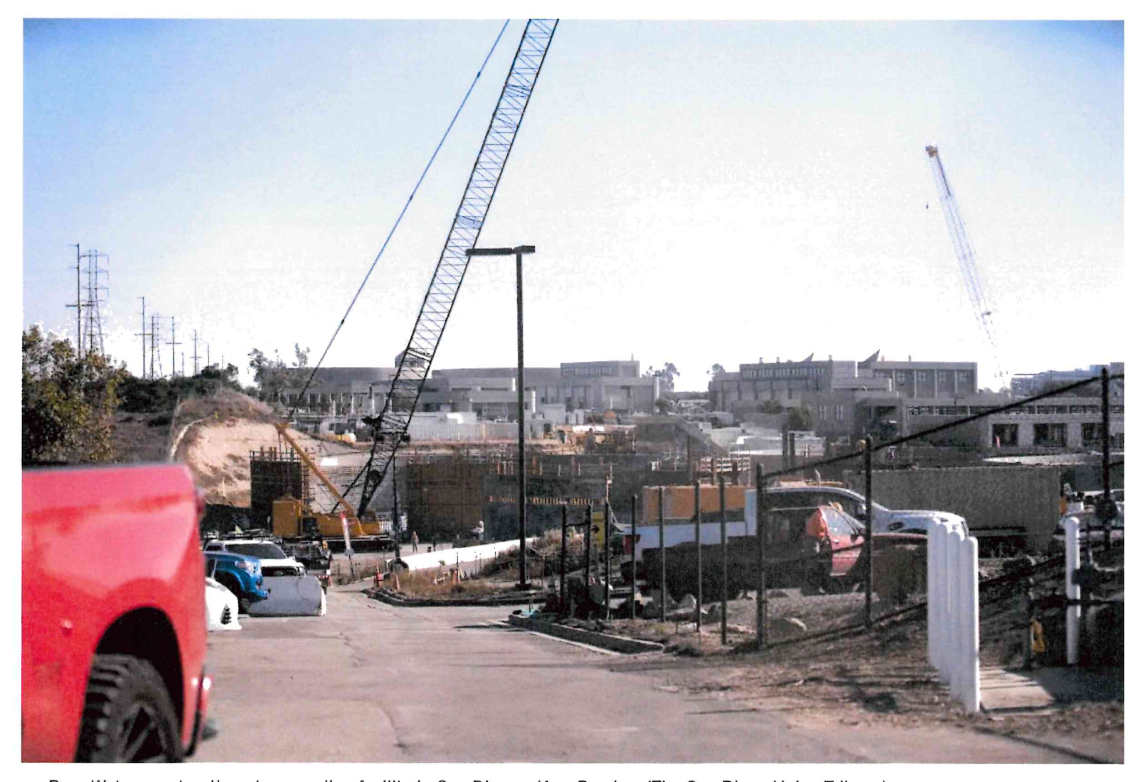
Pure Water construction at a recycling facility in San Diego.